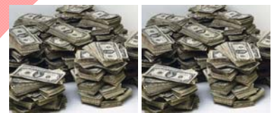
Each image shows $1 million