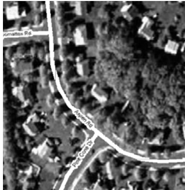
Exhibit A: 204 Aspen Rd., centered in this aerial photo.