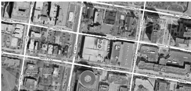
Exhibit B: The Solomon Labs building at Penn (centered). A direct view of Ayelet at work is obscured by the massive roof-mounted fans (and the roof).