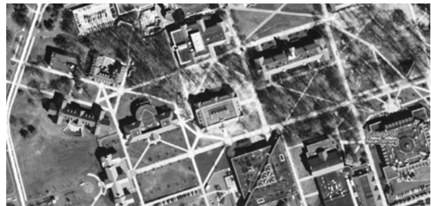
Exhibit C: The Social Science building at TCNJ (centered). Note that Google's satellites either captured this image prior to fall, 2005 or our new library has recently been obliterated.